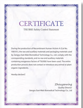
Animal Origin-Free (AOF) Manufacturing